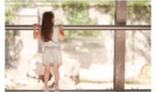
A wall at a zoo