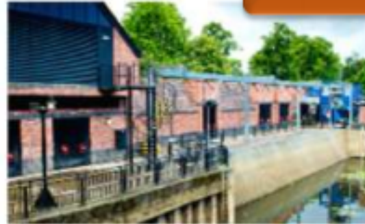
A flood defence wall