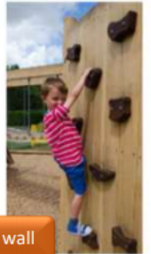
A climbing wall