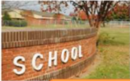
A wall surrounding a school

What do you think each of these walls is used for?